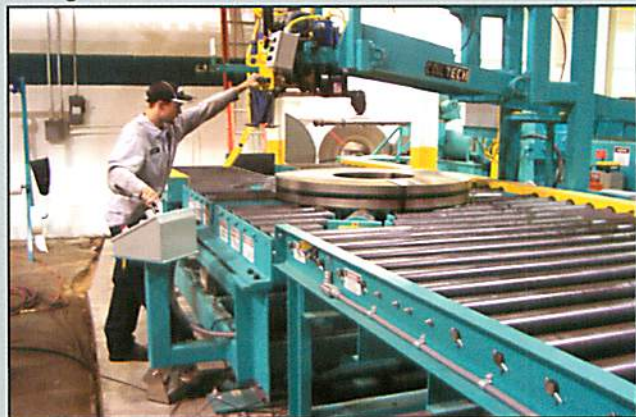
Seal-Less Strapping Head With Electronic Scale

2 Minute Filler Plate Changeover: Patented "Quick Change No-Bolt" 24 inch diameter filler plates complement the 20 inch mandrel. A conventional filler plate change can take as long as 30 minutes plus valuable crane time. The "Quick Change No-Bolt" assembly is mounted on a fixture that is positioned onto the mandrel with the coil unloading car and locked into place by a single draw bolt in minutes.