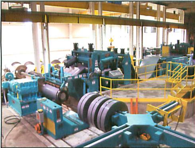
60,000 Pound x 60 Inch Slitting Line

Grand Rapids, MI – H & H Metal Source, a carbon steel distributor of cut sheets and slit coil, has recently installed a 60,000 pound X 60 inch wide X 1/4 inch thick Braner/Loopco slitting line to process cold rolled, coated and hot rolled P&O products. The new "Turret Head" slitting line is designed to slit both mild and high carbon steel up to 70,000 psi shear strength. The line complements a plant expansion project and newly constructed offices.