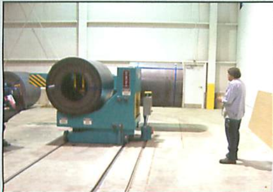
Remote Radio Controlled Coil Car

Coil Loading And Unloading: The entry and exit coil cars are operated by hand held remote radio controls. The remote controlled cars are easier to operate than traditional pendant ones because the operator is not tethered to the equipment by a cord. They allow free access around the equipment and provide clear sight lines while loading and unloading coils.