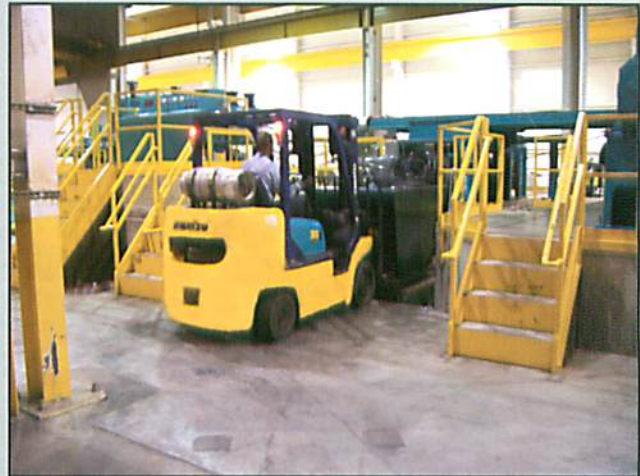
Forklift Scrap Unloading

power gear train that can process 8 cuts in 1/4 inch thick material at 50,000 psi shear strength, 6 cuts in 1/4 inch thick material at 70,000 psi shear strength and up to 30 cuts in light gauge product. The precision machine is tooled with a shimless tooling package that can hold slit width tolerances of plus or minus .002 inches.