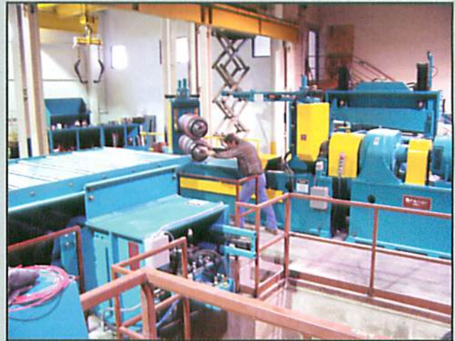
Two (2) Head Turret™ Slitter

Two (2) Head Turret Slitter: A quick change two (2) head turret slitter allows for tooling changes to be made off line while a master coil is being processed. The robust 9 inch arbor head is powered by a 200 horse-