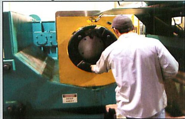
Quick Change "No-Bolt" Filler Plates

Recoiling: A quick change overarm separator with an exclusive "Lateral Adjustment Feature" allows the overarm frame to move from side to side to protect material from edge damage. A 250 horsepower recoiler with a two-speed helical gear reducer can pull almost 25,000 pounds of line tension. Mult tail hold down clamps secure high carbon spring steels from clock springing on the coiler during tail out and banding.